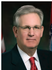
Gov. Jay Nixon

As members of this select group, your strong leadership and dedicated public service allow state government to function more efficiently and more effectively. Your contributions will